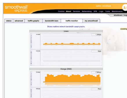
One of Smoothwall's many web-based screens. Here, we see real-time network traffic on the green and orange networks.

If you'd like to give it a try, for a modest (220MB) download you get an ISO image that installs in a couple of minutes. Hardware requirements are minimal. You don't need to know anything about Linux to install it, but you do need to understand the network topology surrounding your firewall or you'll come to a screaming halt, as I did, at the 'Network configuration type' screen.