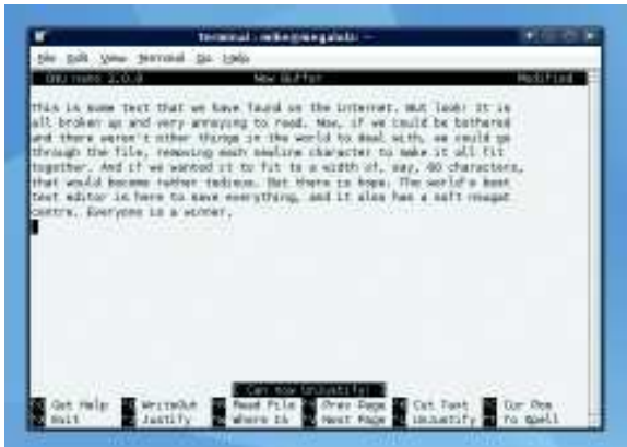
› With a quick tap of Ctrl+J, the text is smoothed out to the way it should be. There is peace around the Earth.

want it to be limited to a certain width, so that it will display on virtually any machine. Different mail clients handle plain text differently, so to make things as simple and reliable as possible, we use nano -r68 newsletter.txt , type away and hit Ctrl+J when we want to format it for sending.