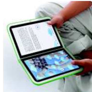
› The second generation of OLPC machines are expected to feature dual touch screens.