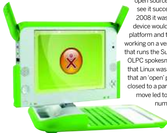
› Will the focus on a Windows operating system really help OLPC to achieve its laudable moral goals?

The project also faces competition from manufacturers such as Asus, Acer and Elonex, who are competing with low-cost laptops of their own.