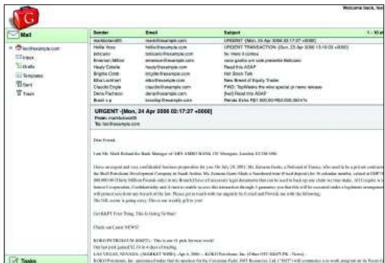
Google Web Toolkit is being integrated into Red Hat's software stack over the next few months, giving developers more choice.

Support for GWT will be added to JBoss Enterprise Application Platform subscriptions over the coming months.