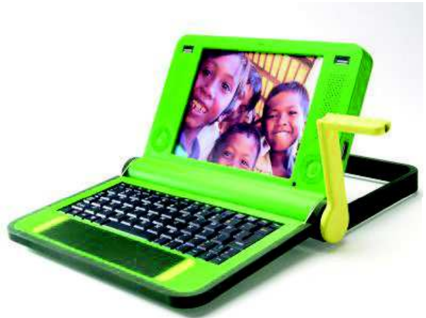
› The design of the OLPC device has varied over the years, but it's never quite hit the magic $100 price point.

The move away from Linux isn't entirely unexpected. The project initially attracted a widespread community of open source developers keen to see it succeed. However, in April 2008 it was announced that the device would become multi-platform and that Microsoft was working on a version of Windows XP that runs the Sugar user interface. An OLPC spokesman said at the time that Linux wasn't being dropped, but that an 'open' platform shouldn't be closed to a particular vendor. The move led to the departure of a number of high-profile contributors who worried that the project had lost